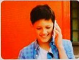
1 talk on the phone

babysit have breakfast have dinner have lunch help my parents listen to music message friends play with my pet read talk on the phone